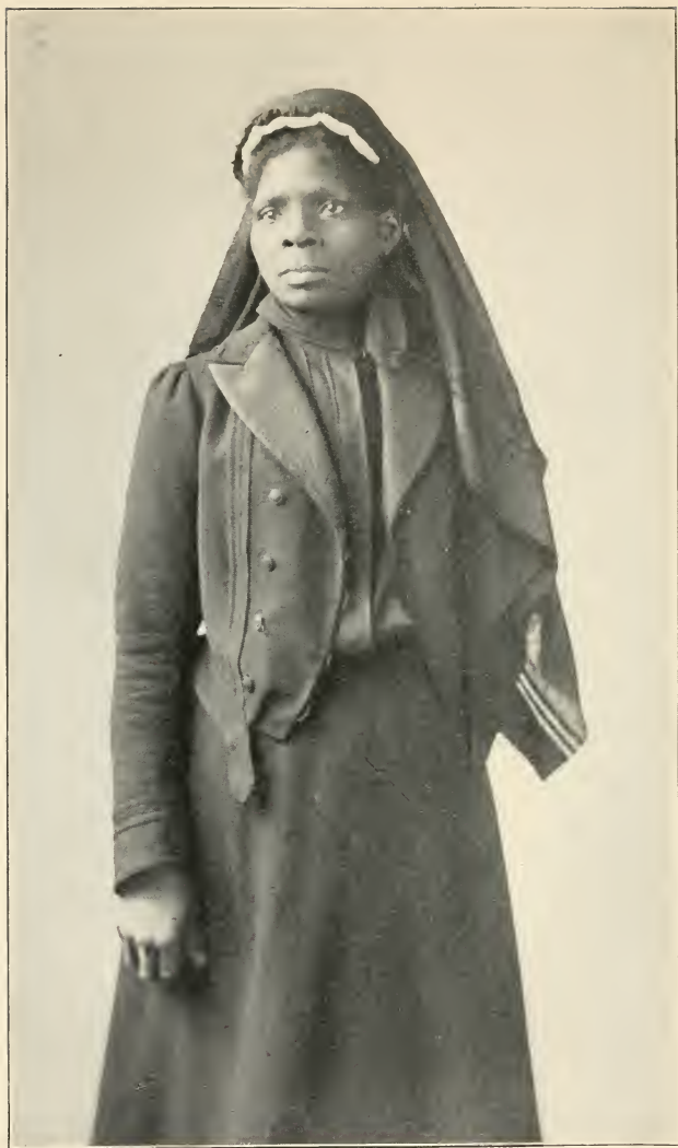
Susie King Taylor.